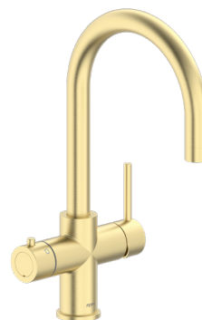
Brushed Brass Gold